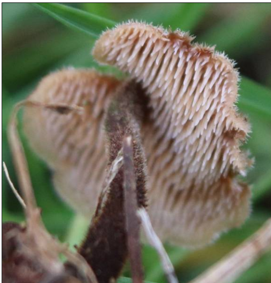
Below and inset, Auriscalpium vulgare found today in litter under Pine on a rotting cone.