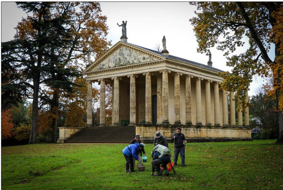
Above, what a backdrop for our walk!

and Yorkshire that they have failed to appear this autumn. That's fungi for you!